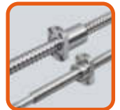
X,Y,Z BALL SCREW