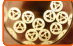
MULTI HOLE ELECTRODE