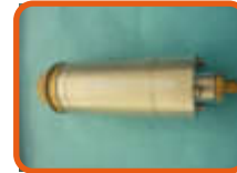
ELECTRONICA DRILL HEAD