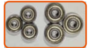
ROLLER BALL BEARINGS