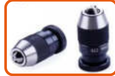
KEYLESS DRILL CHUCK