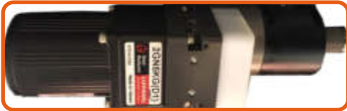
TAIWAN DRILL HEAD