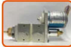
CHINA DRILL HEAD