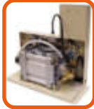
WATER AIR PUMP