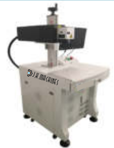
LASER MARKING/ENGRAVING (Pg. No. 14)