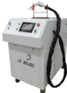
HAND HELD LASER (Pg. No. 12)